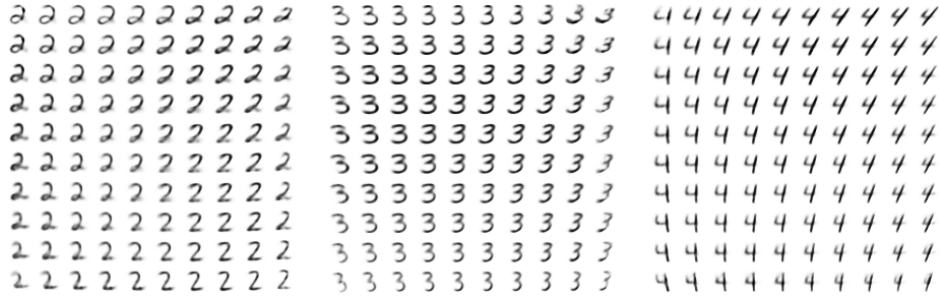
(a) Handwriting styles for MNIST obtained by fixing the class label and varying the 2D latent variable \mathbf{z}